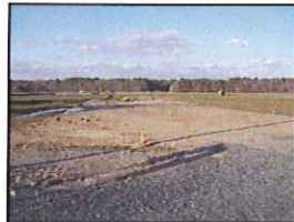
Main entrance to the Centralized Facility

As work progressed this past fall, the farm fields in Westover began to start looking more like soccer and field hockey fields. Unfortunately, the cold temperatures and wet weather have shut down the grading operations on the site until spring.