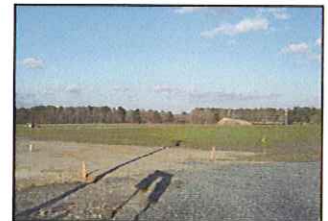
'Soon to be' Soccer and Field Hockey Fields

Currently our strategy will be to have work on the fields begin again this spring once we have winter behind us. If all goes as planned, we will have the grading completed and grass seed planted this spring so that we are ready for a fall field hockey and soccer season.